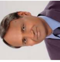
Dr. Udit Raj, N. Chairman

The achievements made by the All India Confederation of SC/ST Organizations under the leadership of Dr. Udit Raj for the welfare of Dalits and majority of other oppressed people in the country, are unparalleled. This is not just rhetoric but a matter of fact. When five anti-reservation orders were issued in the year 1997 by the Department of Personnel and Training, Govt of India, the Confederation organized country-wide movements in the years 1997, 1998, 1999 and 2000 followed by massive rallies in Delhi which led to three amendments to the Constitution. Had this not been done, issues like filling up of back-log vacancies, relaxation in departmental examinations and promotions and benefits of seniority, would have remained in the cold storage for a long time. In fact the mammoth programme on the 4th November, 2001, for conversion to Buddhism in which lakhs of people from all over the country participated was the culmination of our achievements on the reservation front which sent powerful signals not only in the country but in other parts of the world. Think of an organization or a movement whose contribution has been so unique.