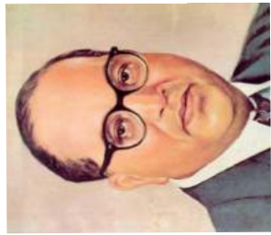
Dr. B. R. Ambedkar