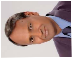
Dr. Udit Raj National Chairman