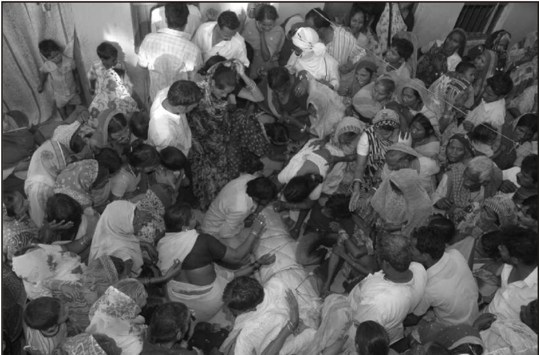
i k&VekV&e ds ckn cgknj I kudj dk 'ko l k& us l s vkuk&dkuh dh tk jgh Fkh] cM& t&ktstgn ds ckn i f&yl dh xkM& ea gh 'ko yukus dh btktr nh x; hA xkM& ds vanj o ckgj ek&st&w i fjtuka dks i f&yl us i hV&KA bl c&jgeh l s gr; k v&js ml ds ckn i f&yl dk , d k jo&S k v&st&h g&per dh ; kn fnykrh g&A

l drk g&Stc oscg&tu l ekt i kVhZ dks ok&V u na v&js t gk&t gkaj k"Vh; v&e; {k} MKND mfnr jkt ds us&Ro ea b&M; u tflVI i kVhZ ds i R; k'kh ppko yM+ jgs g&S ogka ru&eu&eku l s l g; kx n&A l Ei w&kz ekeys dh